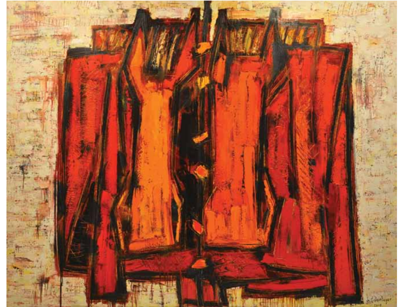
MIRAGE IN WHITE, OIL ON CANVAS