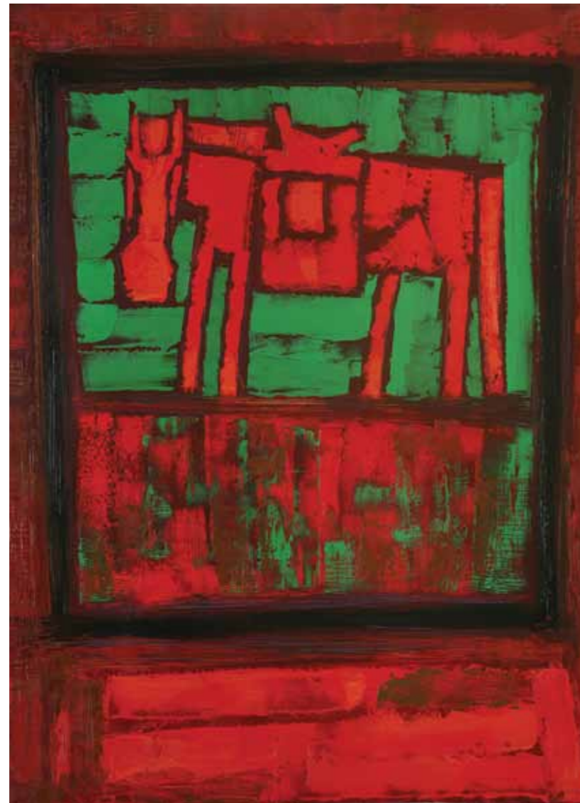
THROUGH THE GER DOOR, OIL ON CANVAS