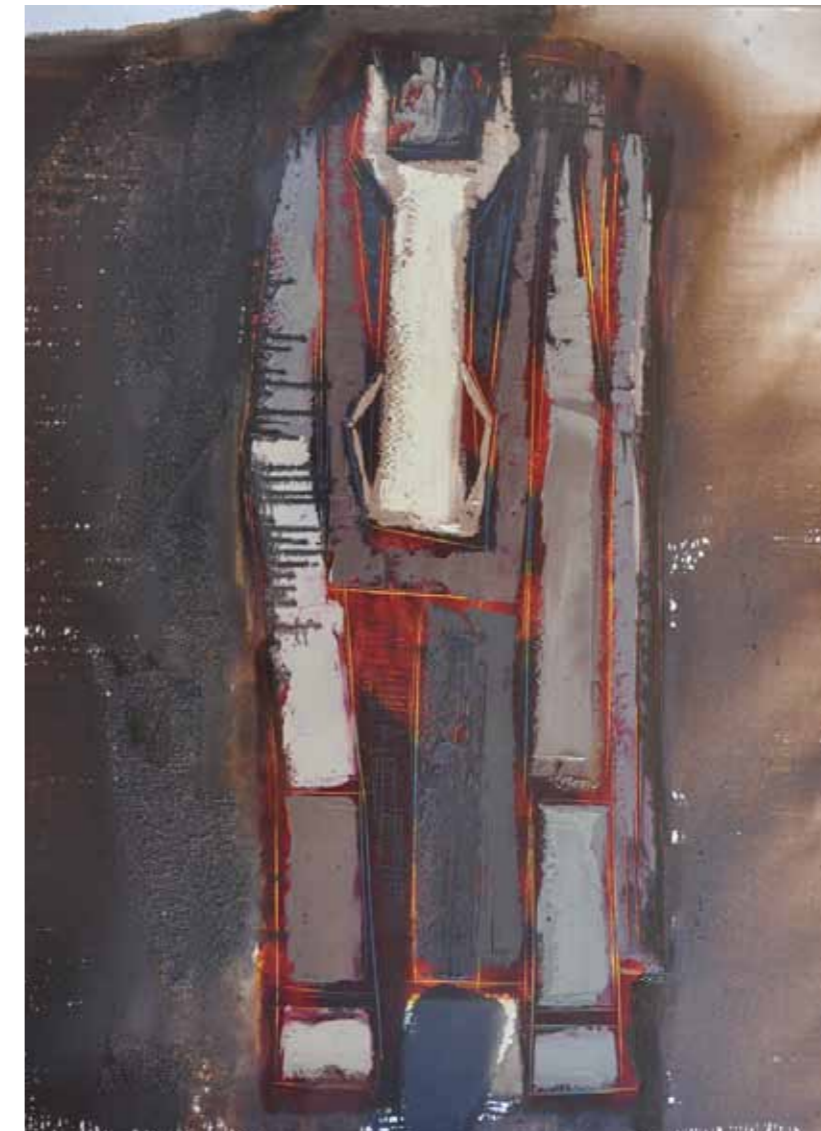
WAVES OF MIGRATION, OIL ON CANVAS