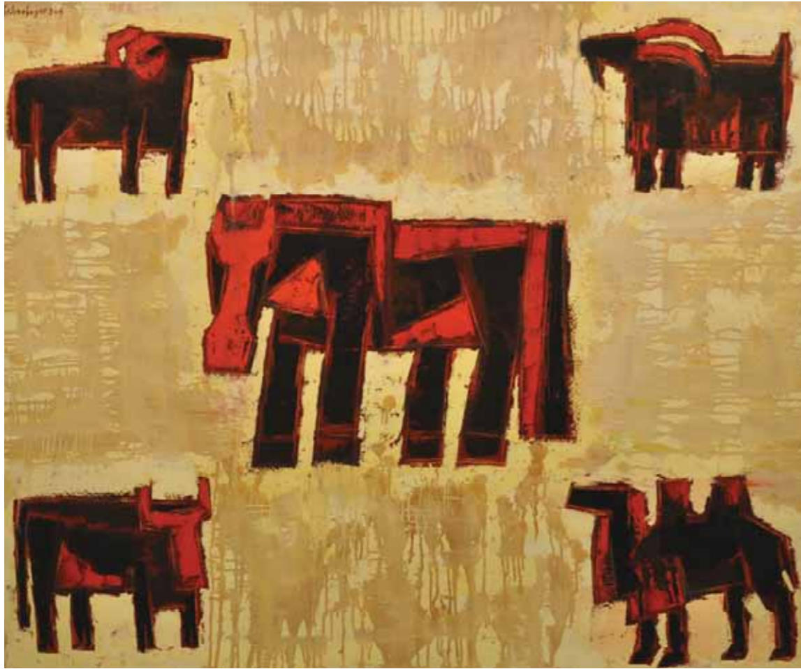
FAMILY COLLECTION, OIL ON CANVAS