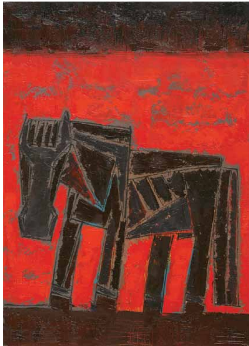
AMULET, OIL ON CANVAS